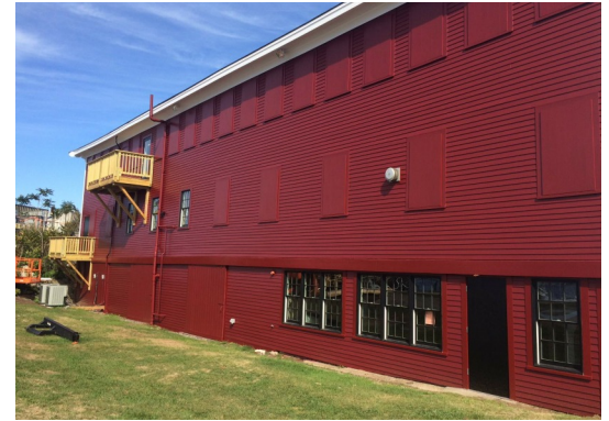
Newly renovated waterside wall - beautiful!

A tremendous amount of planning and hard work went into this remarkable past season. We thank all of you for your participation and support that was so vital to this success! The waterside wall has been completely renovated, truly a major achievement! We now have new siding, new windows, new gutters, a new glass door, and new decks. The Board of Trustees hopes that you are as pleased with the results of the waterside wall restoration as we are. We thank the Amelia Peabody Charitable Fund, the Dusky Foundation, Bank Gloucester and all of you who donated to make this dream a reality!